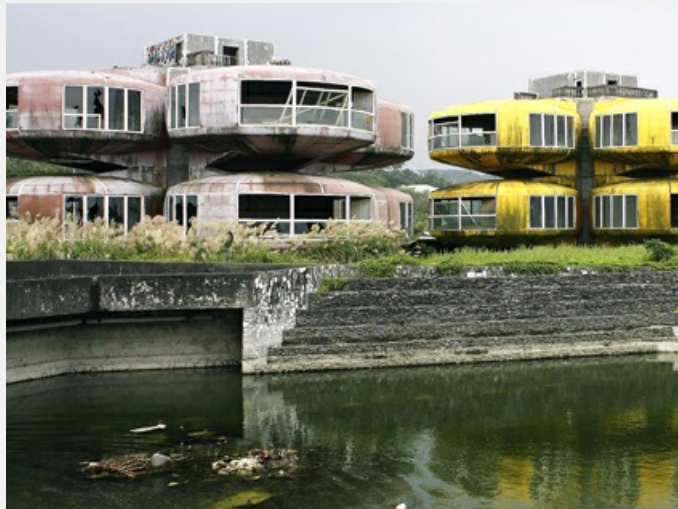
The UFO houses in Taipei County’s Sanjhih Township are pictured shortly on Dec. 29.

“We received an order to tear them down and we plan to finish the job within a month happen to the site afterwards,” said a site supervisor, who wished to remain anonymous.